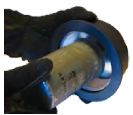
Screw grenade onto Cap

Continuous Discharge Grenade Model# - ALSG272-CS