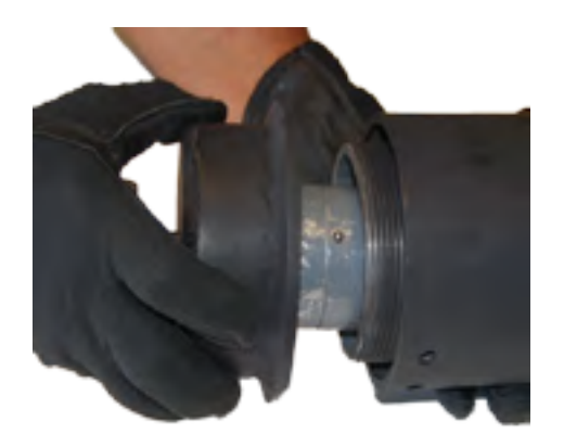
Screw Cap into Body.